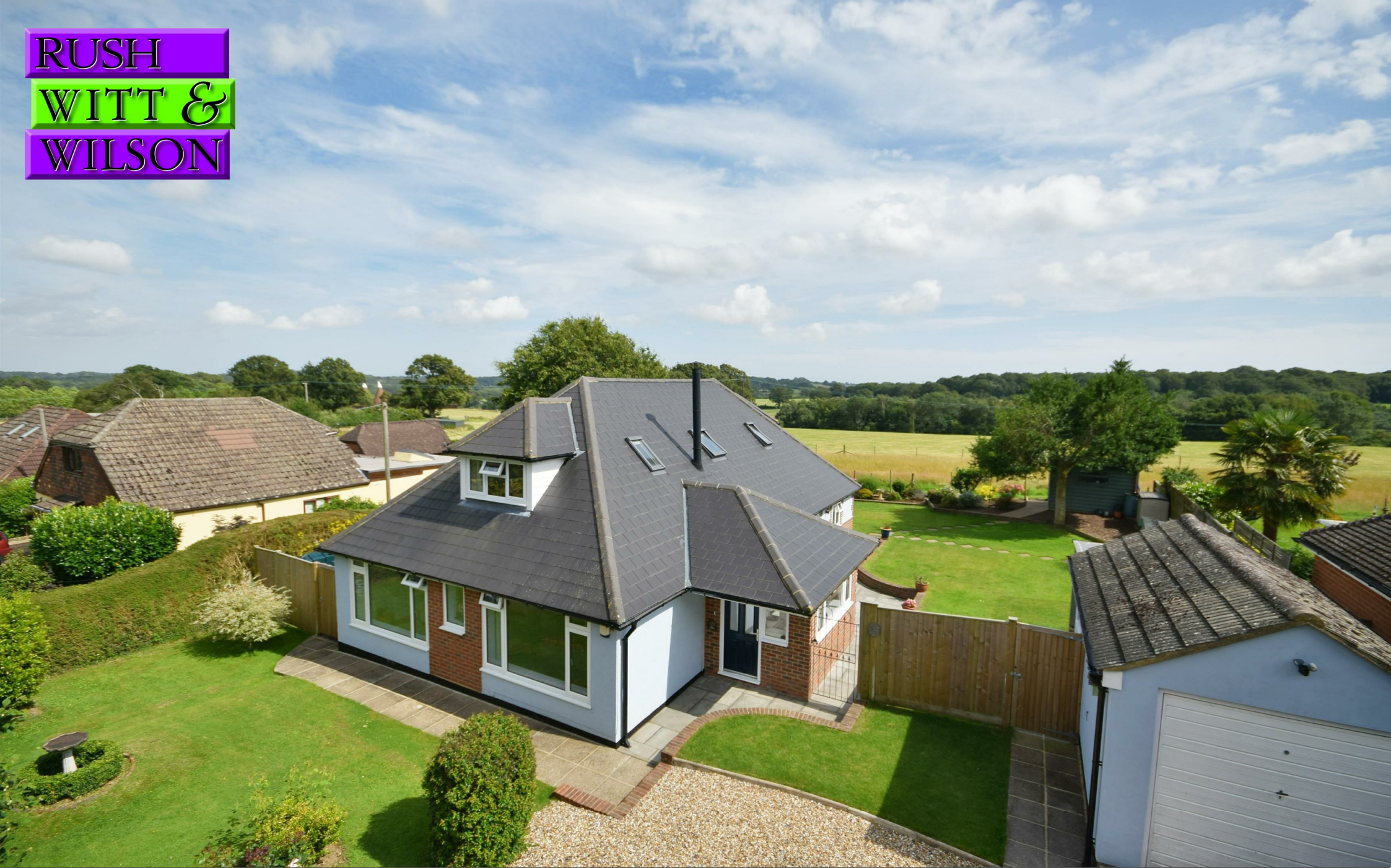
Little Winters, Beckley Road, Northiam, East Sussex, TN31 6JB. £575,000 Guide Price