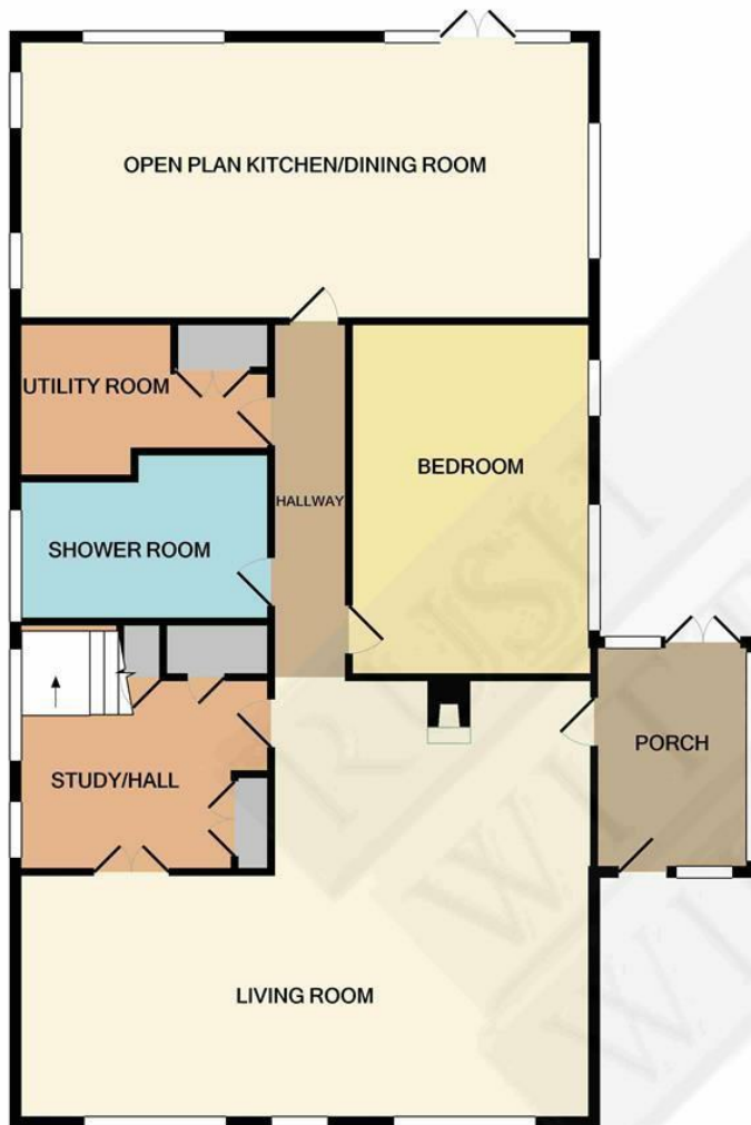
GROUND FLOOR APPROX. FLOOR AREA 1134 SQ.FT. (105.3 SQ.M.)